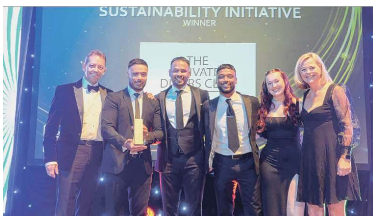
Lavang / Private Diners Club won the Best Hospitality or Retail Sustainability Initiative award

The three other finalists were Marmadukes, who operate three family-run cafes in Sheffield, Rotherham based Mattress Online, who introduced a mattress recycling service, and Rother-