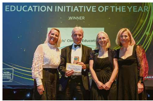
Education Award winner Schools Climate Education South Yorkshire

Schools' Climate Educa tion South Yorkshire, which aims to promote and educate students about climate emer-