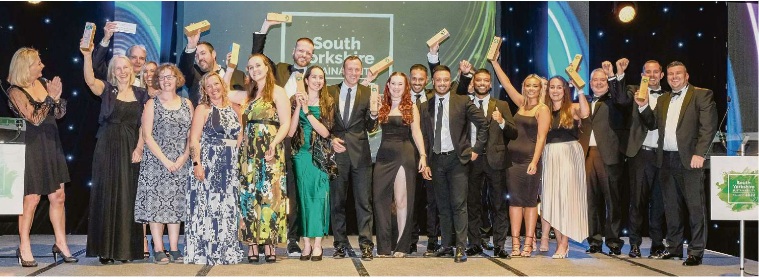
All the winners celebrate on stage at the South Yorkshire Sustainability Awards