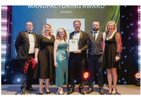
Manufacturing Award winner ITM Power

AESSEAL plc's apprenticeship scheme to help the younger generation find work in a difficult jobs market was also recognised. The Manufacturing